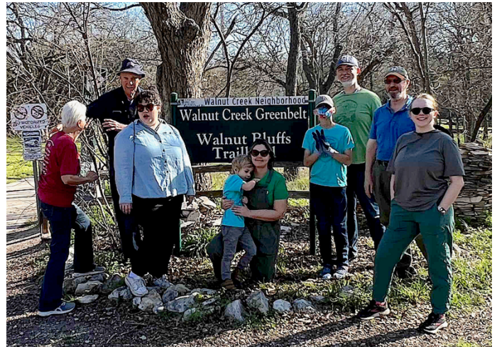
Some of the Early Arrivers at IMPD on March 1st

The next It's My Park Day will be in November . Projects will include planting wildflowers under the highlines.