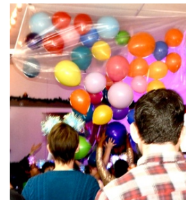
Balloons fall at Noon!